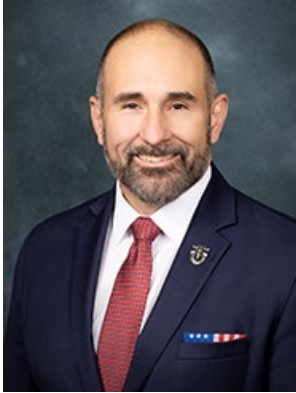
Sen. Jay Collins

Occupation: Chief Programs Officer of a national 501(c)(3) with a focus on food needs in and out of disaster zones